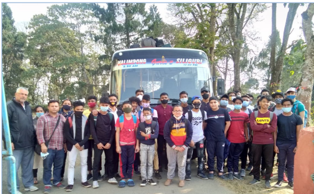
Pupils returning to school after the pandemic closure

GO Patron and former UK Committee member