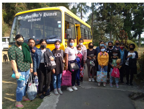
Students returning to school after the protracted Covid enforced break