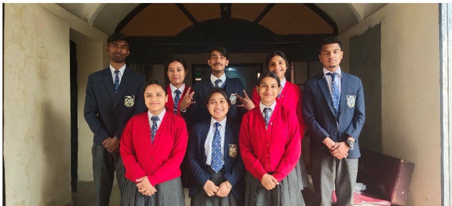
ISC 2021 boarders, happily back at the Homes, preparing for their exams (photo March 2021)

Life has also been busy at the Homes. In the December newsletter we mentioned that the Class XII children, who are taking their Indian School Certificate (ISC) exams this year, were just returning to the Homes, along with the children from Class X, who are taking their Indian Certificate of Secondary Education (ICSE) exams this year. They have all settled back well, and are working hard studying for these exams, now scheduled to be taken in May and June. Due to Covid-19, it is as challenging this year as it was in 2020 for children to make any definite plans for their future. We have written to each of this year's school leavers (ISC 2021) and have had a lovely letter back from each one, in which they have given us their contact details so that we can stay in touch as they tentatively take their next steps after leaving the Homes. Please do pray for them as they start this important stage of their life journey.