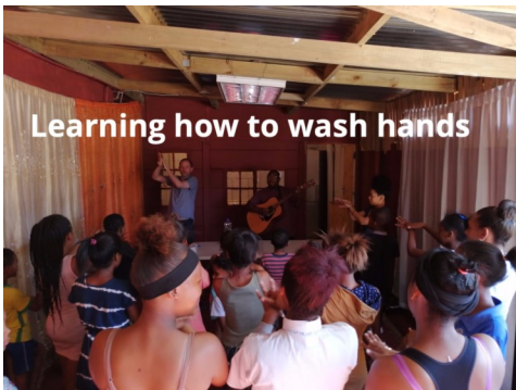
Learning how to wash hands