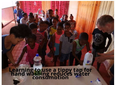
Learning to use a tippy tap for hand washing reduces water consumption