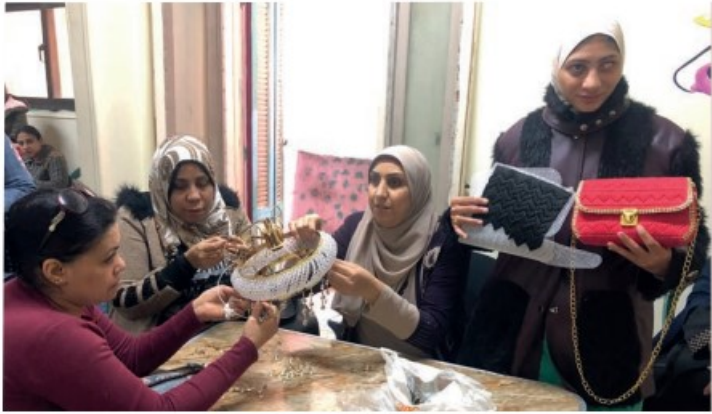
Learning crafts is just one of the activities

Please pray for everyone at Embrace and their partners who work so hard to support individuals and communities in extreme need. Please pray for Najwa